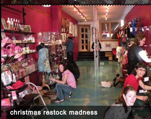
christmas restock madness

The most original local and handmade retail concept! Art and craft :: mostly one-off gifts for everyone in Australia's first franchised handmade retail gallery. Have a look at what's in-store at www.incube8r.com.au Find out more; sign up for our newsletter and find out about all our latest arrivals!