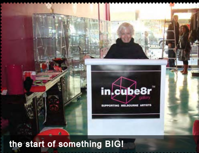
the start of something BIG!