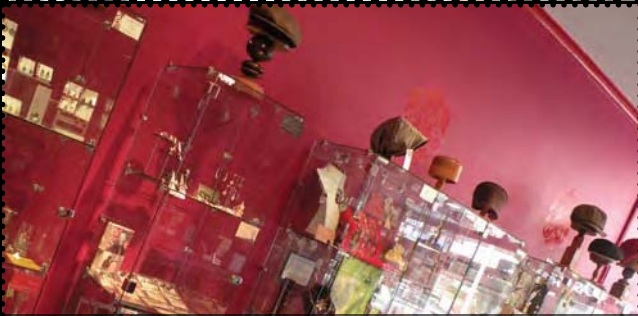
smiths street, fitzroy